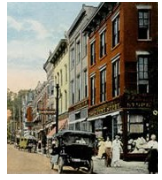
Wall Street, Kingston, c. 1907