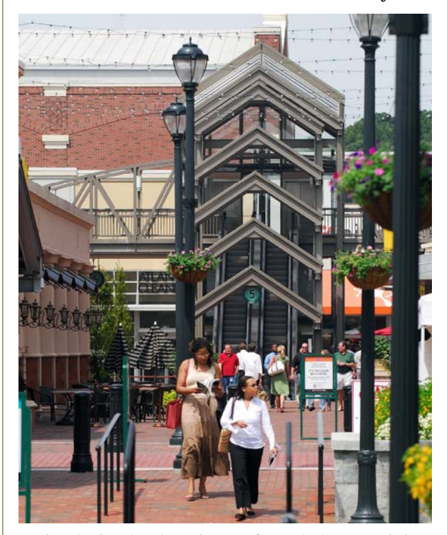
Atlantic Station in Atlanta, Georgia is one of the most successful examples of Traditional Neighborhood design in the country

The popularity of TNDs as a preferred form of development is increasing rapidly. In a major shift of public taste, according to studies by Smart Growth America and the Urban Land Institute, more homebuyers