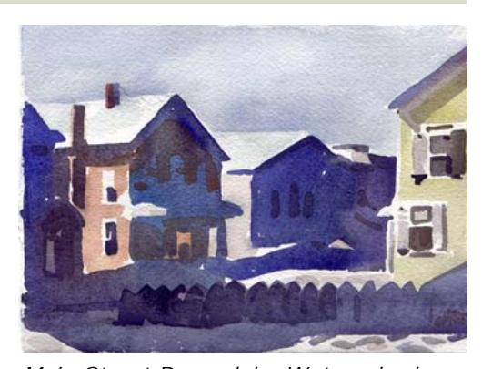
Main Street Rosendale, Watercolor by resident artists Staats Fasolt

Board Box 1800 244 Fair Street Kingston, NY, 12401 Phone: (845) 340-3340