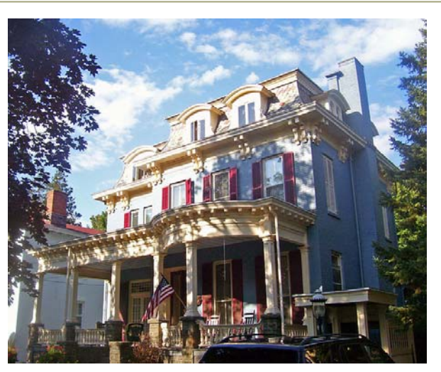
The Chichester House on Fair Street shows the importance of the front porch in Kingston's traditional architecture.

Many TND's encourage front porches in a large percentage of homes to recreate the social interaction that has disappeared from most of our current subdivisions. Simply moving the houses closer to the street and providing tree-lined sidewalks do not guarantee pedestrian interaction. However, locating porches close to the sidewalks alls residents to converse with neighbors as they pass by. Contrary to most conventional subdivisions, traditional neighborhoods encourage residents to become acquainted with their neighbors.