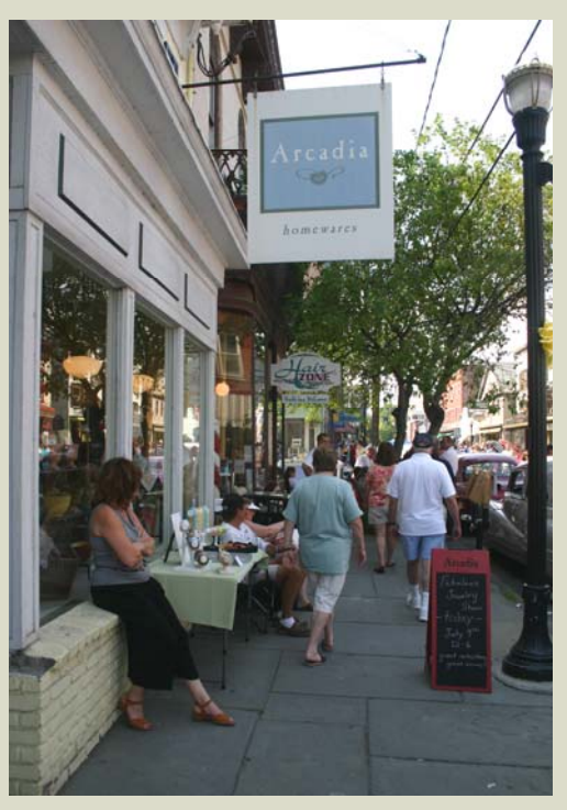
Partition Street, Saugerties

Young professionals, families and empty nesters are flocking back to downtowns and "walkable" traditional neighborhoods. kinds of communities have earned the moniker "Cooltowns" because they are sustainable, and attract professionals in the "creative class" (www.cooltownstudios.com). Saugerties earned that title in a recent tourism publication. Growing Cooler: The Evidence on Urban Development and Climate Change, A new book by the Urban Land Institute, shows that the majority of future housing demand lies in smaller homes and lots, townhouses, and condominiums in neighborhoods where jobs and activities are close at hand. To find this book and find out more, visit Urban Land Institute at www.uli.org and Smart Growth America at www.smartgrowthamerica.org or